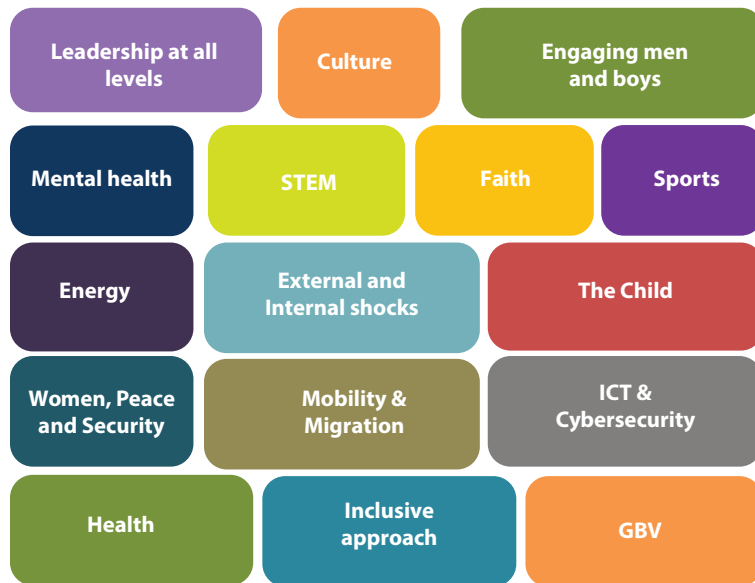
Diagram 3-Emerging Issues