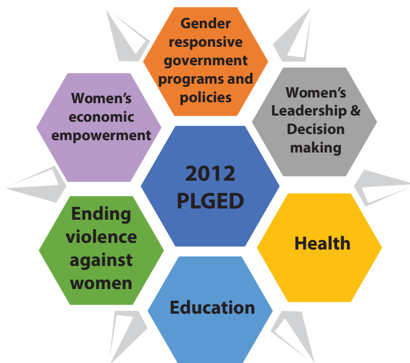
Diagram 2-2012 PLGED focus